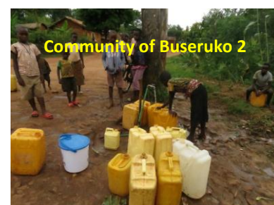
Community of Buseruko 2