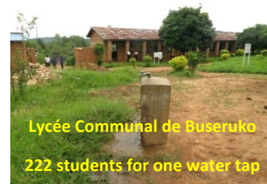
Lycée Communal de Buseruko 222 students for one water tap