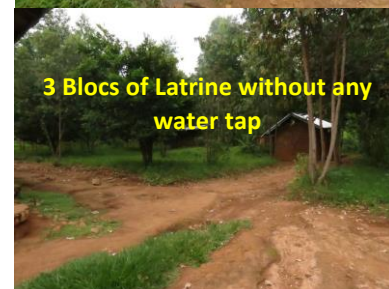
3 Blocs of Latrine without any water tap