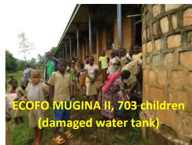
ECOFO MUGINA II, 703-children (damaged water tank)